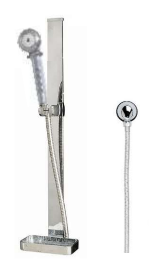
101P / 115P