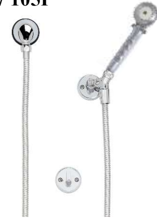
101P(G) / 115P(G)